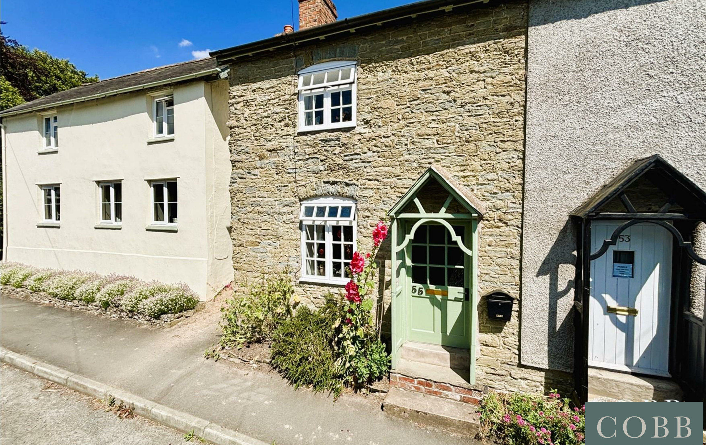
55, Watling Street, Leintwardine, SY7 0LL Price £350,000